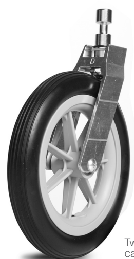
Two pivoting caster wheels